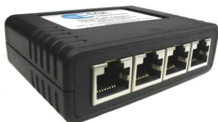
Quad RJ45 UTP Splitter Part No: E10170S