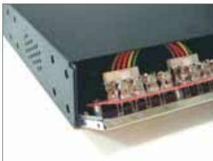
Flip down front panel